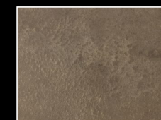
Chocolate PF08 Tile