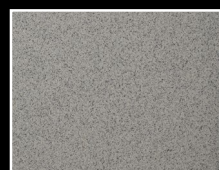
Quartzsite Rock - 309