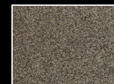
Quartzsite Rock - 304