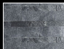
Ostrich Grey Ledger Stone